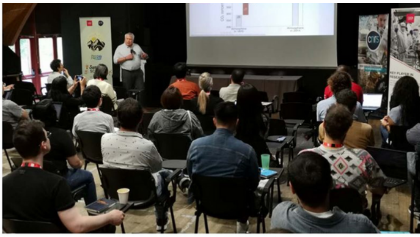
RD20 Summer School Report, Prapoutel, France, July 2-7, 2023